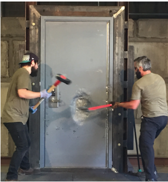
Image from actual forced entry testing

The Forced Entry Bullet Resistant Assembly from Pioneer combines ballistic and forced-entry resistance with advanced materials to provide an elevated threat protection solution compliant and third party tested per stringent Department of State Standard SD-STD-01.01 Rev. G (Amended).